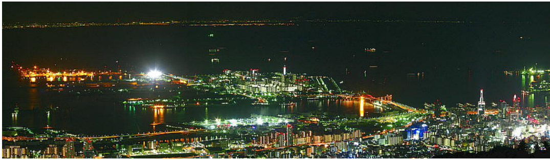
Night view of the Port Island from Rokko Mountain