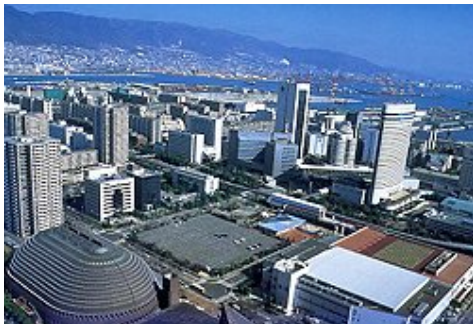
View of the Port Island, Kobe

http://www.kcva.or.jp/e-convention/index.html