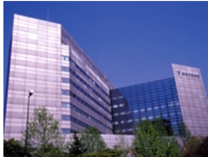
International Conference Center Kobe